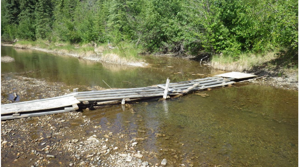
Man-made bridge during June sampling.