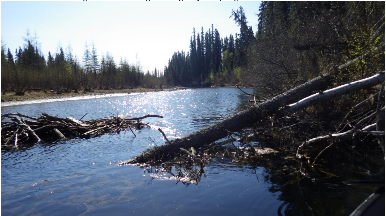
Old dam site on lower Piledriver in May.