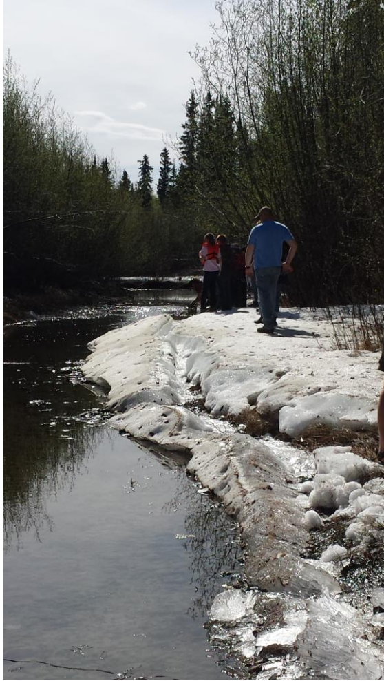
Aufeis and snow along Piledriver slough during May sampling