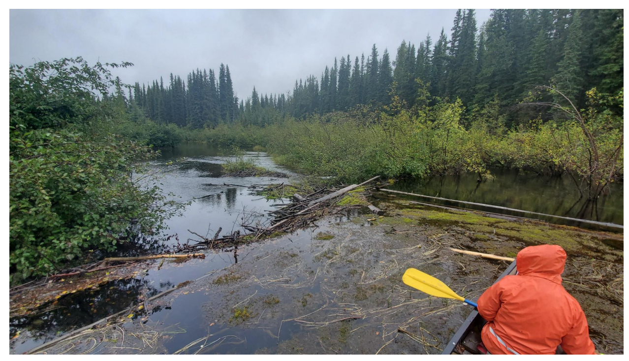
Site 4 Dam during August sampling seen from the top