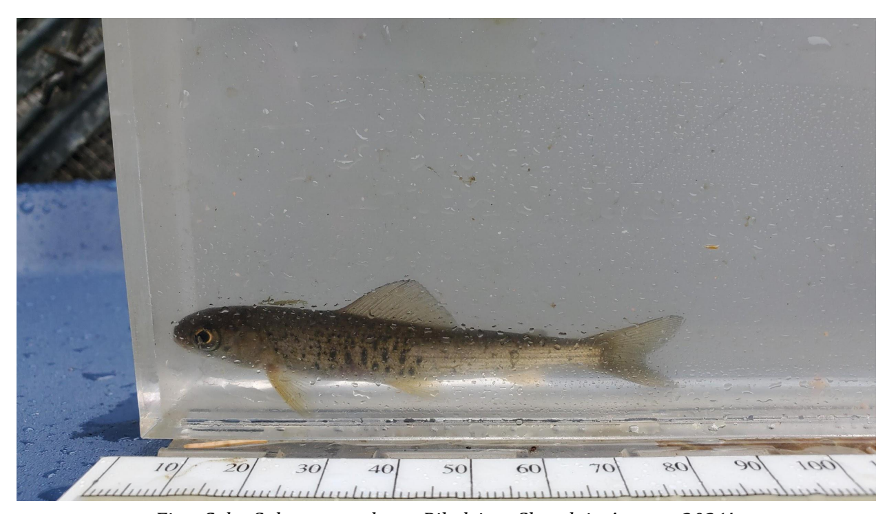
First Coho Salmon caught on Piledriver Slough in August, 2021!

Tanana Valley Watershed Association December 4, 2021