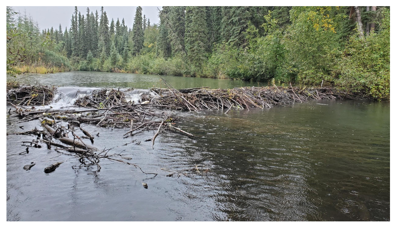
Site 2 seen from below during August sampling, note natural breach.