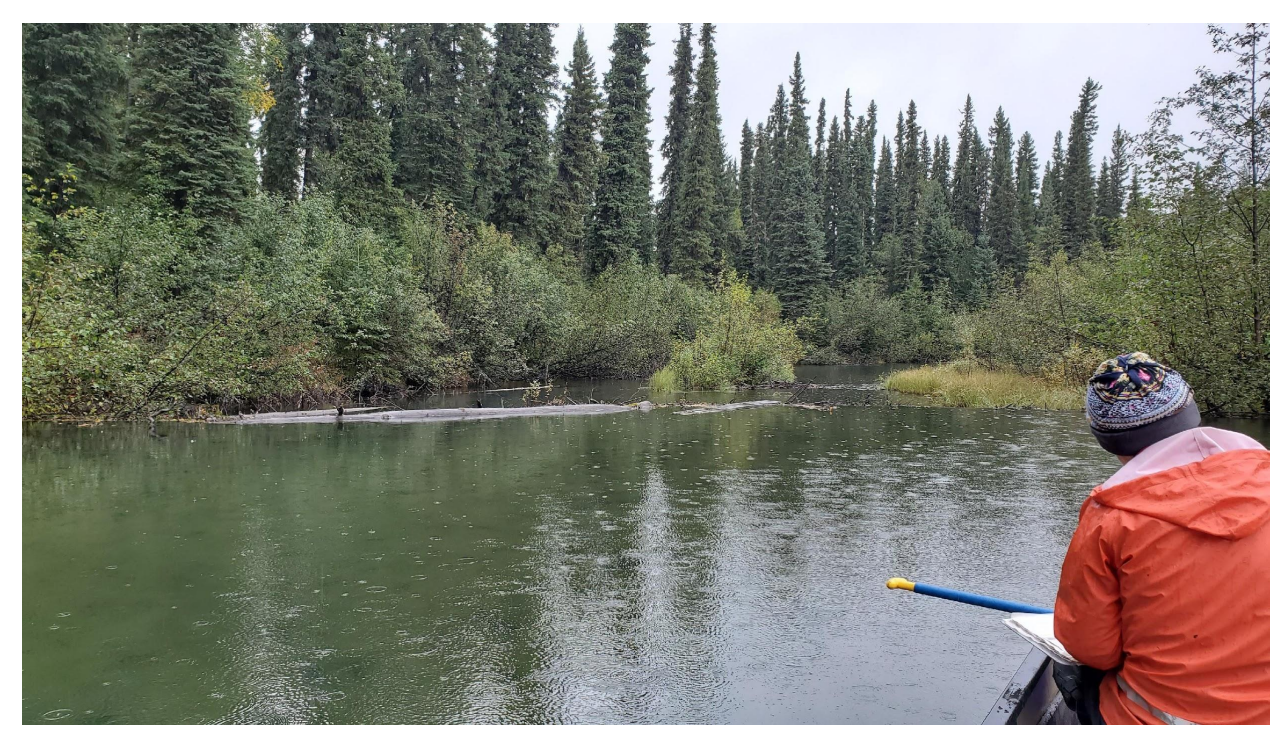
2019 Dam 1 looking downstream during August sampling, passage was not being blocked during the high water.

This was a secondary dam located just downstream of Site 2. 2019 was the first year that we have observed a dam at this location and it continued to be inhabited in 2020. It indicates the spread of the beaver colony in this area. In 2021 this dam did not appear to be actively maintained.