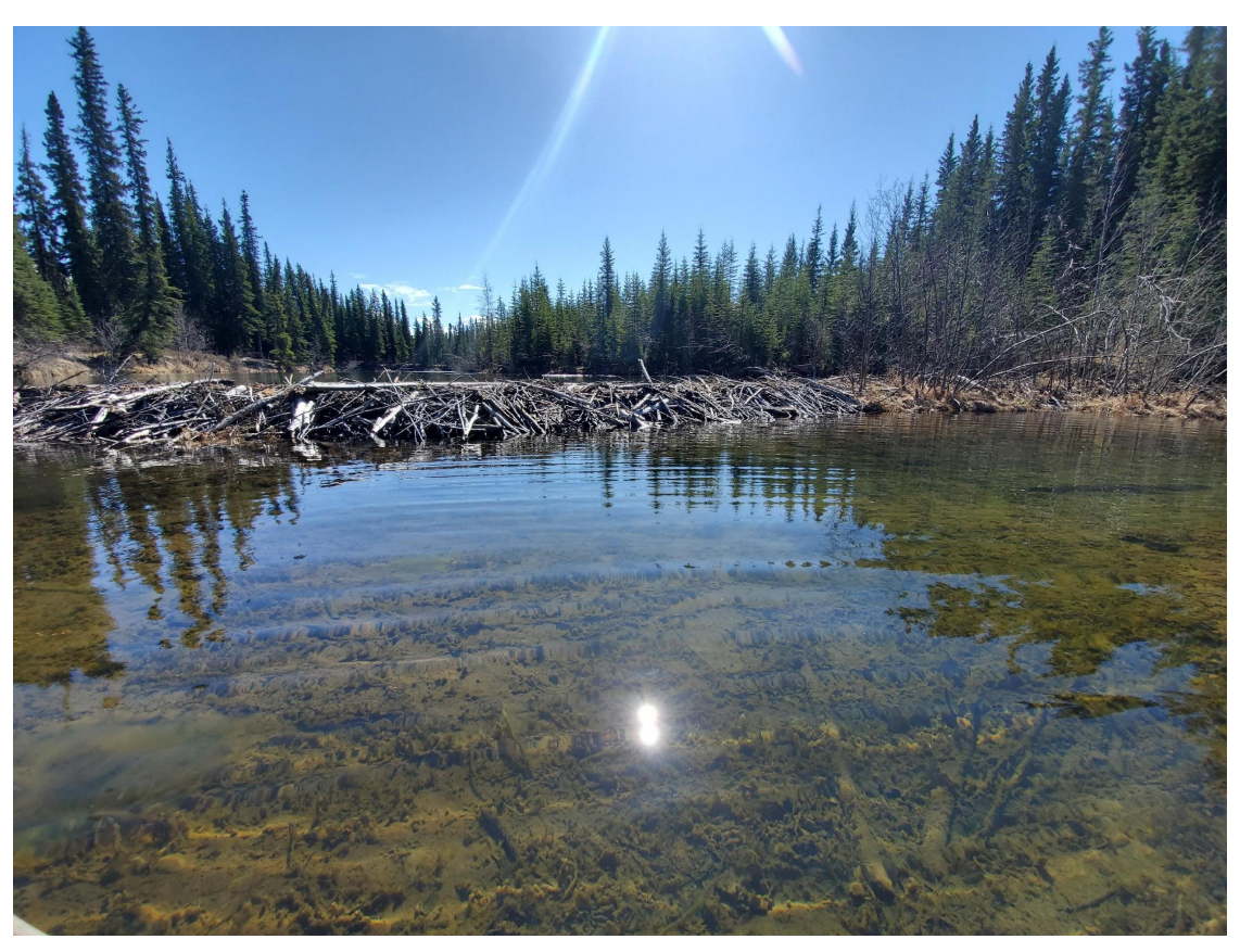
Site 1 from downstream looking upstream during May 2021 sampling, note algae.