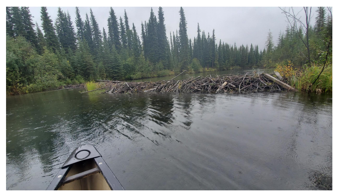
Site 1 from downstream looking upstream during August sampling with higher water.