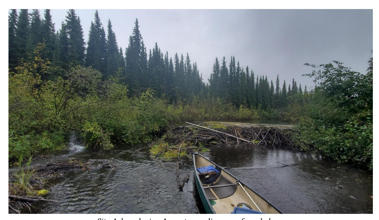
Site 4 dam during August sampling seen from below.