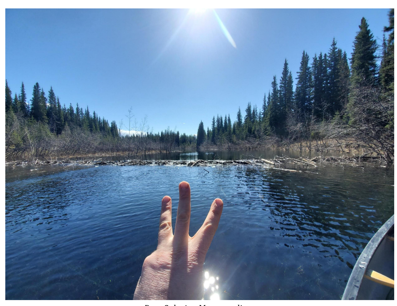
Dam 3 during May sampling.