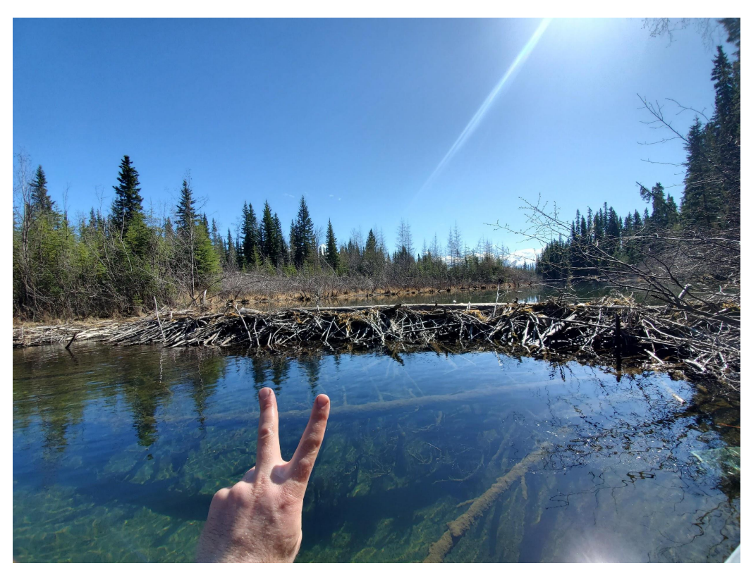
Site 2 seen from below during May sampling.