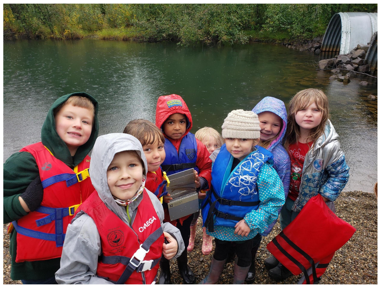
Salcha students with lake chub at site 4 during August 2021 sampling.

Fish Sampling: TVWA's "Chena Salmon" sampling protocol was used for recording information on fish. Gee-type minnow traps (23 x 45 cm, 0.64 cm wire mesh, with 2.5 cm diameter openings) were baited with salmon roe and set 5-10 mm apart for a 24-hour soak time (Swales, 1987). After the 24 hour soak, scientists identify and count all fish in the trap and determine length using a Photarium viewing box (Duvall, WA, USA). Fish were released after identification and measurements were taken. Any incidental fish deaths were labeled and brought to the USFWS laboratory in Fairbanks for further processing.