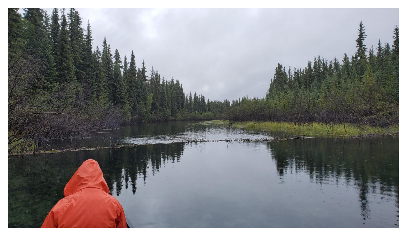
Dam 3 site during August sampling.