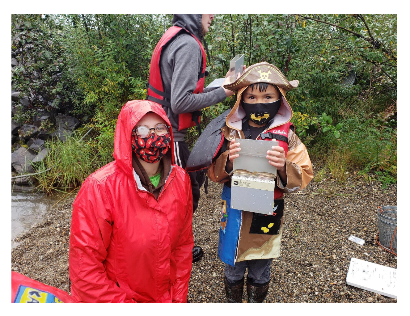
Salcha Elementary student and teacher with 2 lake chub at Upper Piledriver Site 1 during August sampling.

In 2021 TVWA field staff did not observe any adult or juvenile salmon on upper or lower Piledriver Slough. 2021 was a notably bad year for Summer and Fall Chum Salmon in the Tanana River drainage, the run was late and far smaller than usual, and fishing was closed on these species. For the second year in a row, we observed fewer than usual of the schools of Arctic Grayling on Lower Piledriver Slough and attribute this lack to the prevalence of large beaver dams.