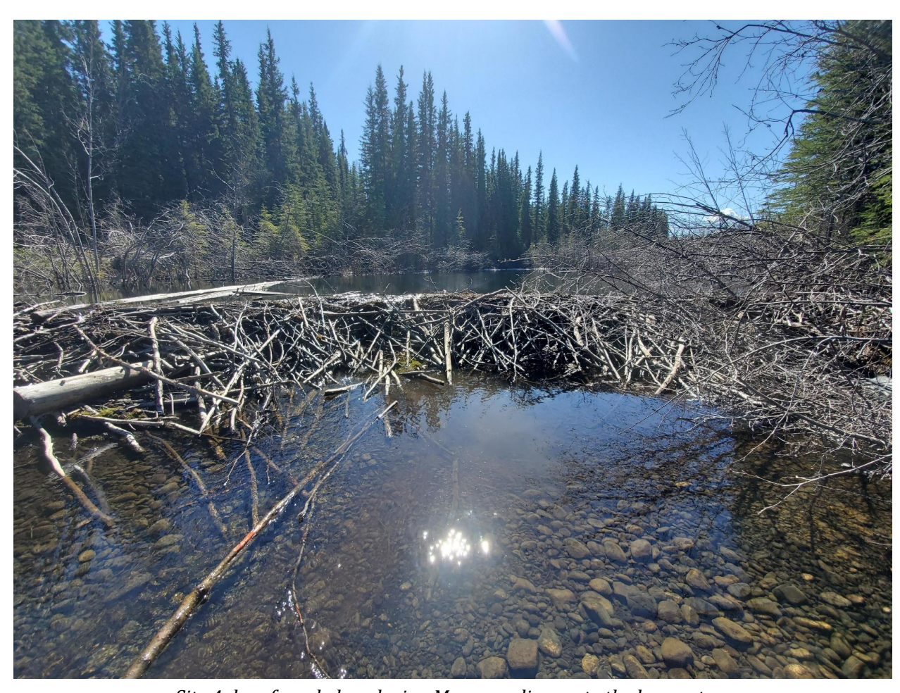
Site 4 dam from below during May sampling, note the low water.